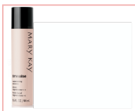
Skin Replenishing Serum +C $56