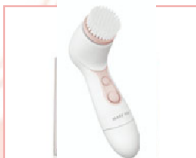
Skinivorate Brush $50