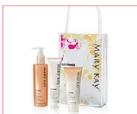
Satin Hands Set $34