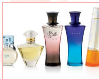
Choice of any fragrance $28-$40