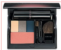
Custom Compact (filled) $70