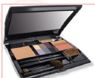
Compact Pro (empty) $35